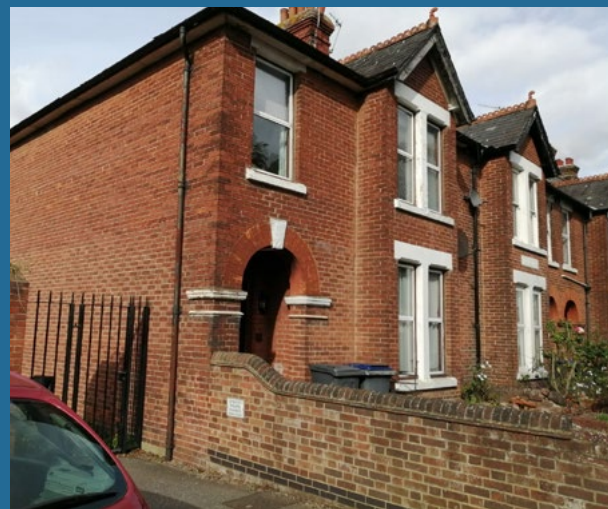
Sycamore House, Canterbury.